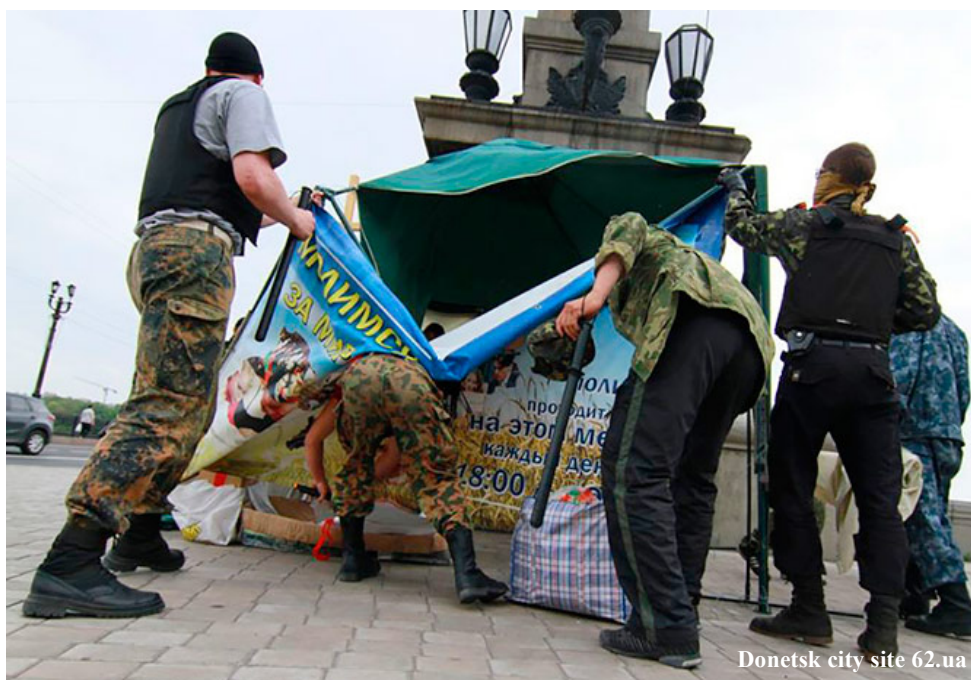
Pro-Russian combatants break up the Prayer Marathon in Donetsk Constitution Square, May 2014

As of March 2015, prayers in are held in secret, in the homes of the very few pastors and congregation members that have remained in occupied Donetsk.