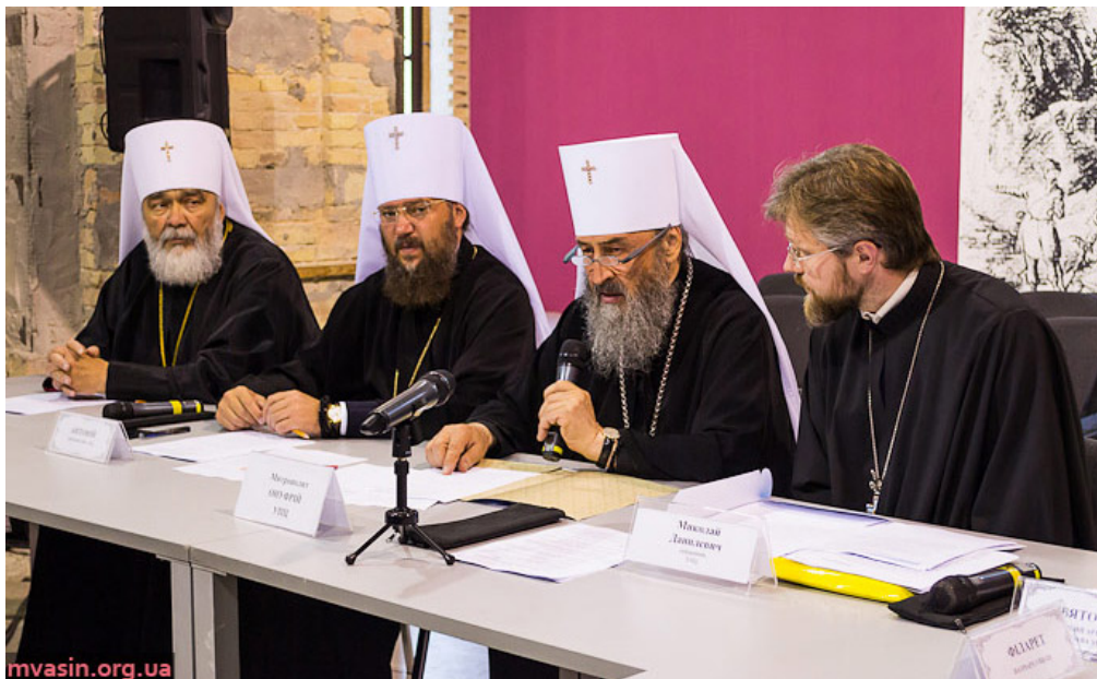
Ukrainian Council of Churches and Religious Organizations (UCCRO) deliver a joint statement on the military conflict in the east of Ukraine, July 2014

The Moscow Patriarchate of Ukrainian Orthodox Church has generally avoided taking sides, denouncing aggression by both parties and calling for peace.