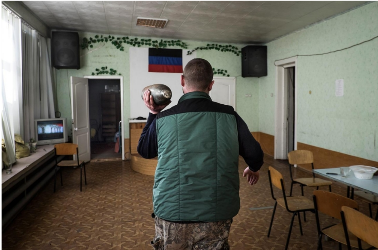
A rebel fighter carrying a live round through the Church of Christ, Donetsk, March 2015.