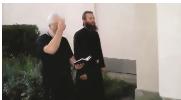
Snap shots from the video made available by the illegal pro-Russian combatants of NONA-C systems firing from the Kind News church property (left) and the prayers of Orthodox priests which accompanied this (right), Sloviansk, June 2014