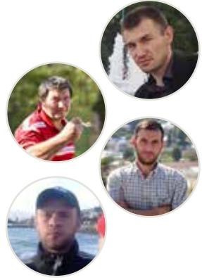
Recently these four Crimean Tatar Muslims were arrested in Feb 16

Lawyers have faced problems while trying to gain access to the arrested in at least 11 cases